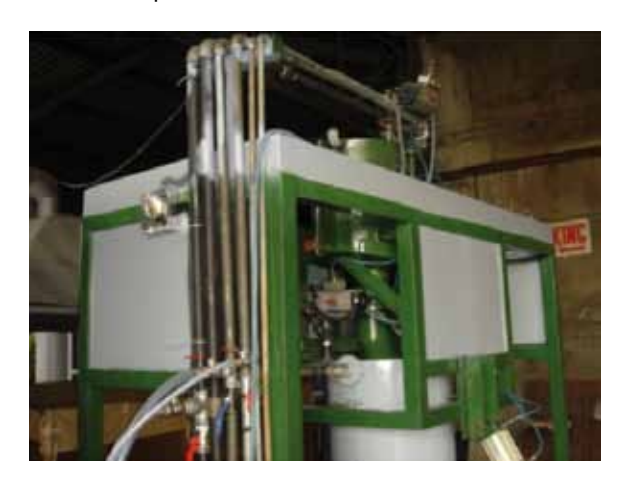
Locally designed and fabricated Box Foam Machine by Pamaque Nig. Ltd.

The Montreal Protocol funds were not spent on the development of the local brand. Apart from being easier to operate, the local product meets all Montreal Protocol requirements.